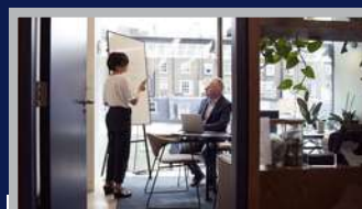
Tax Agent Certification