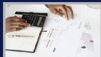
Diploma of Accounting