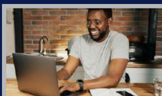
BAS Agent Registratoin Skill Set