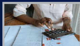
Accounting Principles Skill Set