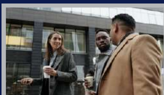
Advance Diploma of Conveyancing