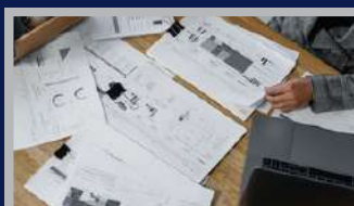
Certificate IV in Accounting & Bookkeeping