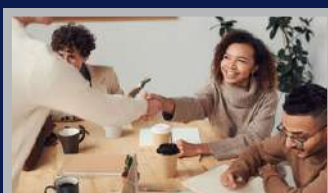
Advanced Diploma of Accounting